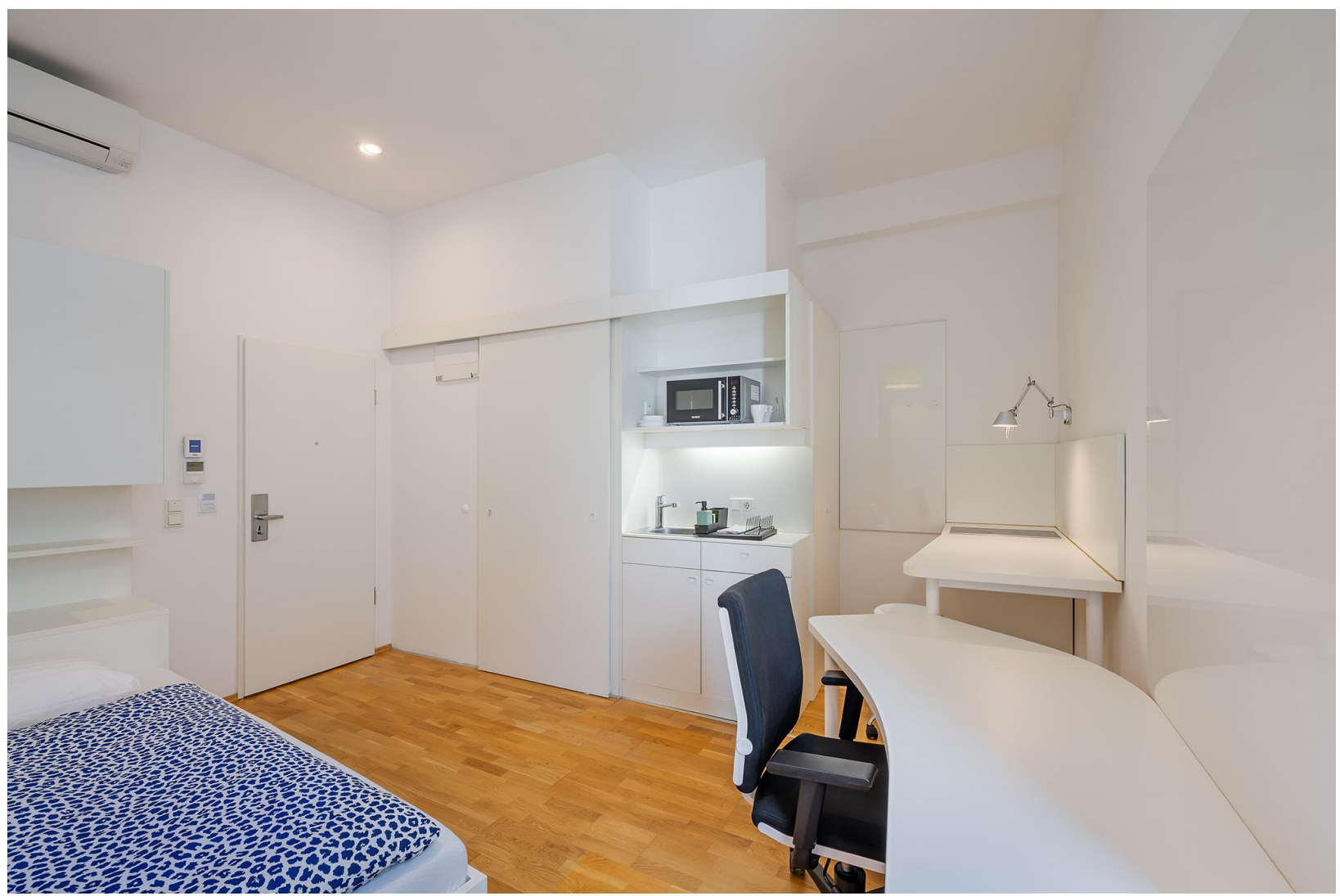
19 m 2 one-bedroom apartment with kitchenette and private bathroom