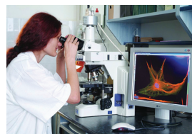
Work at a university laboratory

Besides educating foreign students, the university maintains extensive relations with over 100 higher education institutions abroad, including the State University of New York (USA), Heidelberg University (Germany), the Karolinska Institute (Sweden) and Saitama Medical University (Japan).