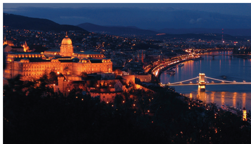
Picturesque Budapest by night

Besides educating foreign students, the university maintains extensive relations with over 100 higher education institutions abroad, including the State University of New York (USA), Heidelberg University (Germany), the Karolinska Institute (Sweden) and Saitama Medical University (Japan).