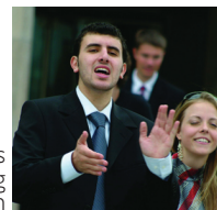
Students celebrating graduation

The university is a truly international community , embracing over 11,000 students from 60 nations over five continents. Its five faculties (schools) offer a wide range of courses from undergraduate to doctorate level in Hungarian, English and German. Foreign students account for close to 20% of the total community.