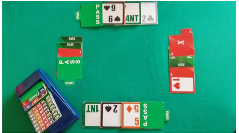
Bridge while bidding

This class is great for anyone who has never touched a pack of card before and for anyone who loves playing cards. This game is the combination of card games and chess and it will accompany you in the rest of your life, you won't be lonely, it's a program in youth, a constant occupation in the older age. It will always keep you vigilant mentally.